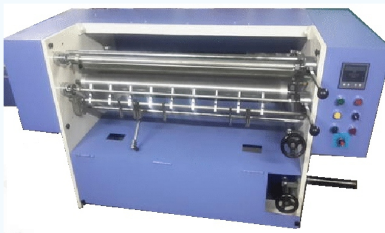
Thermal Transfer Ribbon Converter Machine

6 Color with UV Online Lamination, Corona Treater, BSF Video Cam.